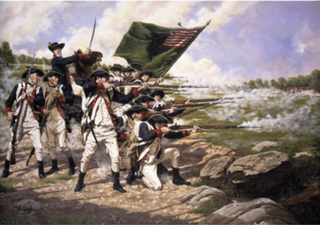
The Delaware Regiment at the Battle of Long Island, August 27, 1776