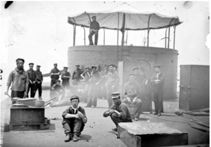
James River, VA Sailors on deck of U.S.S. Monitor, July 9, 1862