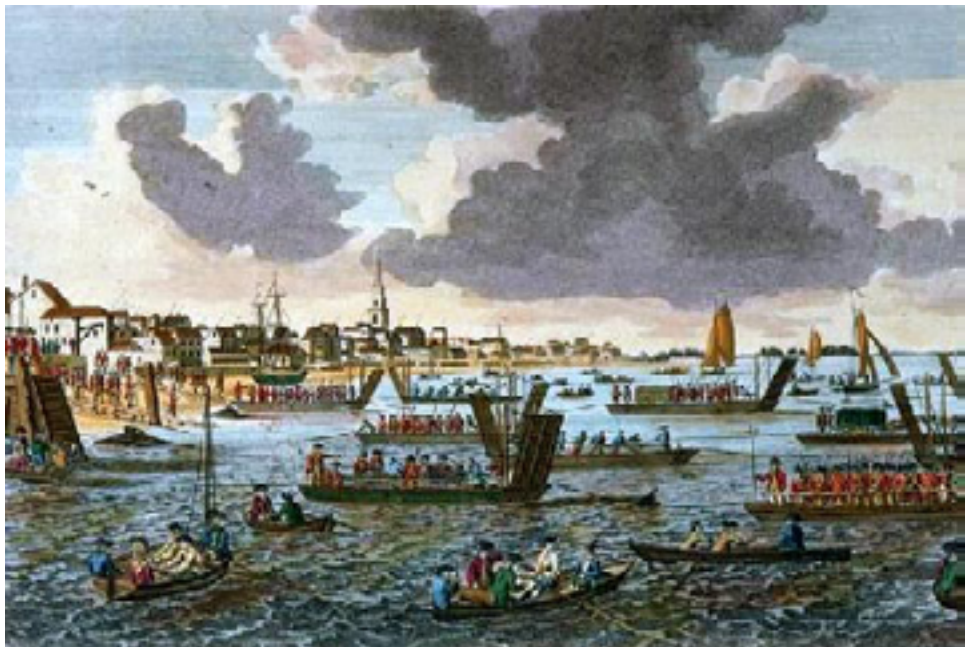
British Troops landing at Kepp's Bay